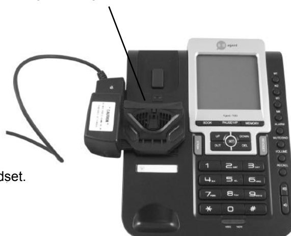
PLACEMENT OF LIFTER

Remove the handset from your telephone. Secure the handset lifter over the loud speaker on your telephone, using the attached adhesive tape. Ensure the ring detection sensor is placed centrally over your telephone's speaker. Plug the lifter cord directly into the port on your DECT base station. You should now be able to answer/end calls using the answer button on your cordless headset.