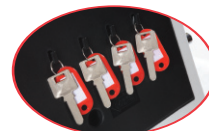
Internal Key Hooks DS2001 & DS2002 only

Shown with optional extra multi media trays