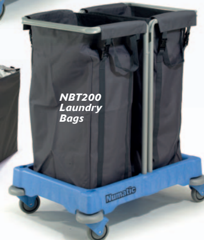
NBT200 Laundry Bags

Even our bag system is unique - easy to remove, easy to close and easy to move.