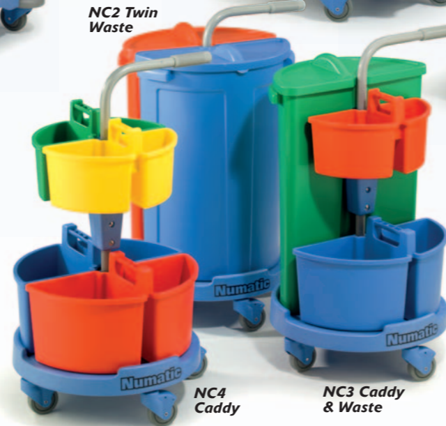
NC2 Twin Waste

Carousels are the perfect example of small being beautiful with a 5 model choice; two with spot mopping; one for twin waste only; one for waste and storage and one for 4 caddy storage.