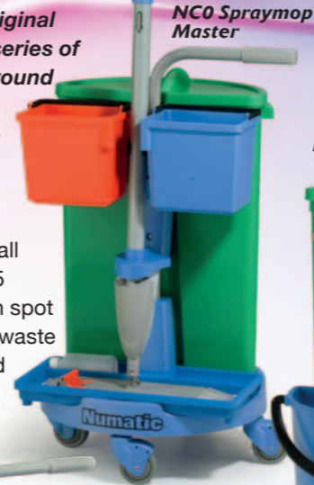
NC0 Spraymop Master