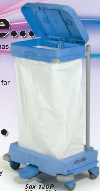
Sax-120P Waste Unit

The NX-1001 is a Numatic original and a favourite for more than 20 years. Available in a choice of 5 colour waste bags, allowing colour coded use and which can also be used with standard 120-litre poly waste bag liners.