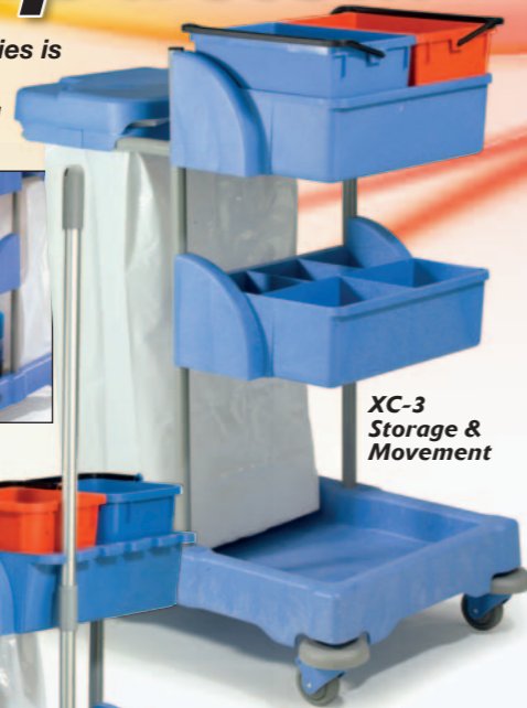
XC-3 Storage & Movement

Two models provide a choice of convenience mopping facilities for spot cleaning, all have a full 120-litre lidded waste unit and a pair of pails. The XC-3 provides maximum storage space.