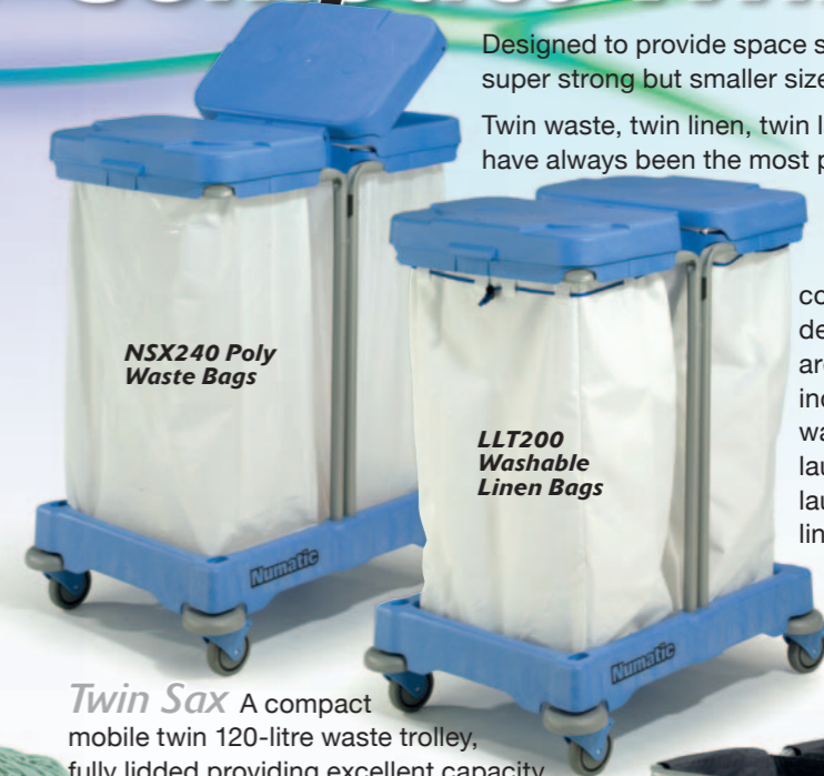
NSX240 Poly Waste Bags

commercial establishments and due to the common dual end design, twin splits are also possible incorporating waste/laundry or laundry/linen, etc