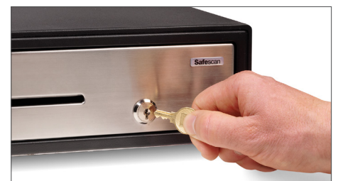
With 3-position lock (locked, stand-by and open)