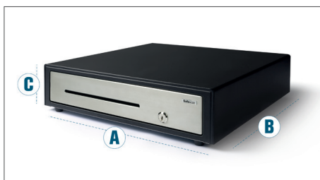
Dimensions: A: 41 cm - B: 41.5 cm - C: 11.5 cm