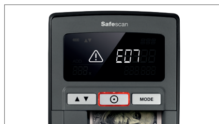
Visible and audible counterfeit banknote alarm