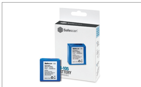
Safescan LB-105 Rechargeable battery Art. no: 112-0410