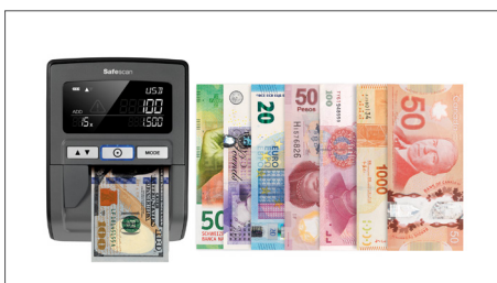
Verifies 8 currencies in all directions