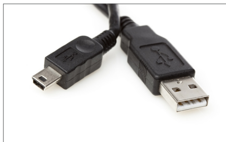
Safescan USB update cable Art. no: 112-0459