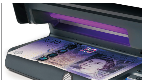
Ready for the new polymer banknotes