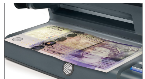
Large LED white light area to verify watermark, metallic thread and microprint