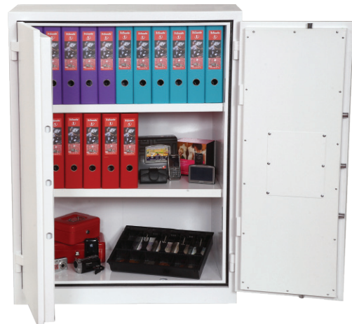
Fire Ranger FS1512K