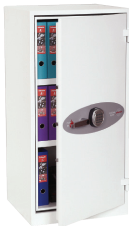
Fire Ranger FS1511E