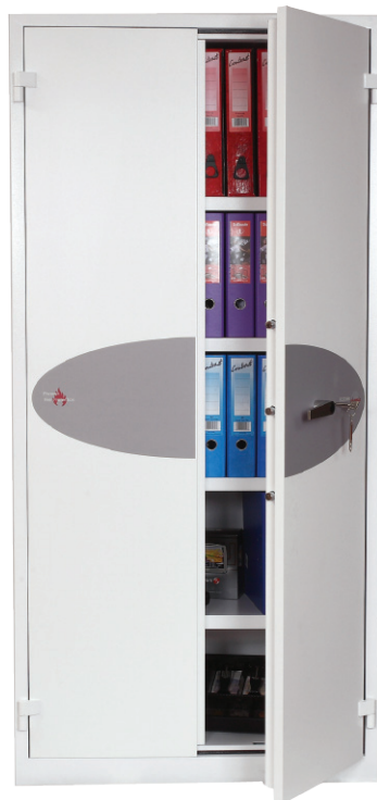
Fire Ranger FS1513K