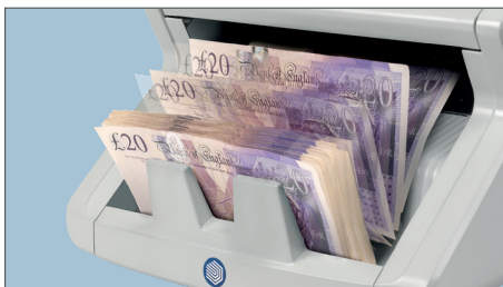
HIGH-SPEED COUNTING OF SORTED BANKNOTES