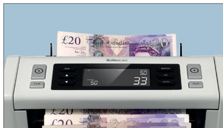
UV COUNTERFEIT DETECTION