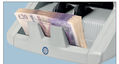
ADJUSTABLE BATCH FUNCTION FOR CREATING EQUAL STACKS OF BANKNOTES