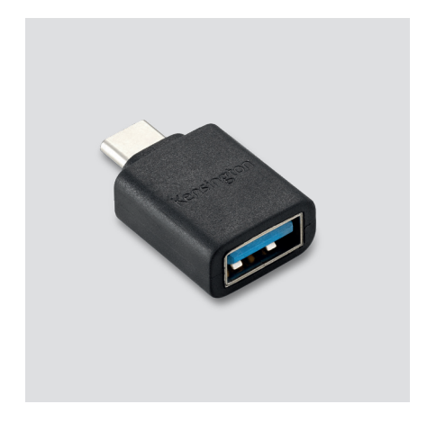
Simple USB-C to USB-A M/F Connevctivity Provides easy connection between USB-A devices and newer USB-C devices - without losing important usability features.