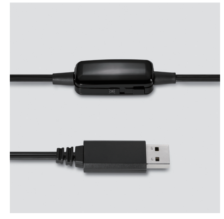
Volume and Mic Mute Controls Uses passive resistance technology to filter out ambient noise for optimum speech clarity. Easily adjust volume and mute the microphone with easy-to-reach controls built right into the USB cable.