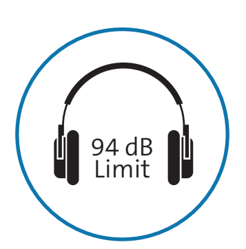
Safe Listening Limit Sets the maximum output to 94db to protect ears from hearing loss associated with excessive loudness.