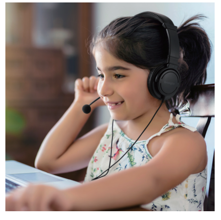
Outstanding Comfort & Robust Design Designed to fit heads of all ages, the adjustable headband is padded and the foam ear pads are wrapped in a soft leatherette cover to provide hours of comfortable use. The flexible boomstyle microphone can be rotated up to 270°. Durable materials, including a 1.8m USB cable that allows for flexible movement make this headset ideal for learning environments, call centres, business professionals and gamers.