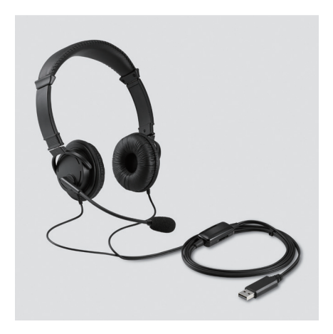
Exceptional Sound 40mm drivers with deep bass and a wide dynamic range deliver an excellent listening experience.

Part Number: K33065WWE | EAN Code: 5028252634311