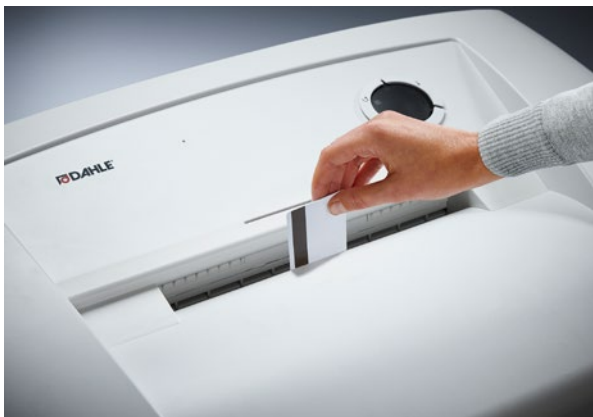
Reliably destroys cards