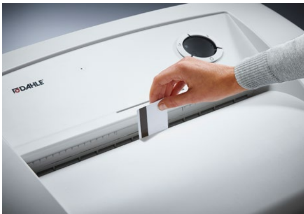
Reliably destroys cards