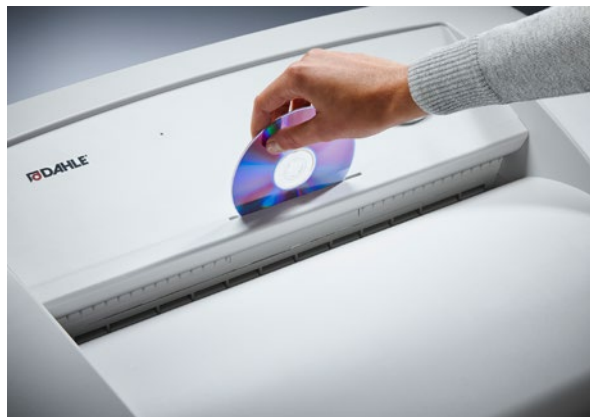
Separate CD feed opening with dedicated collection bin for environmentally friendly waste separation and secure destruction