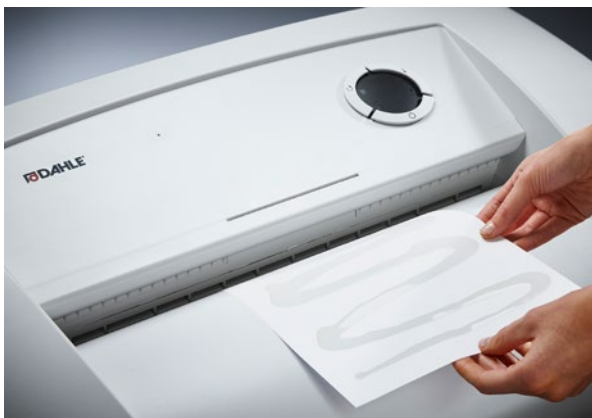
Dahle Waste 216 document shredder