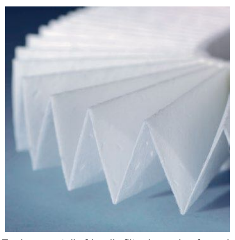
Environmentally friendly filter is made of speci- Powerful fan sucks in fine dust particles inside al 3-ply, fully recyclable non-woven material