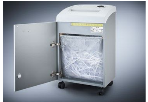
Dahle Waste 104air document shredder