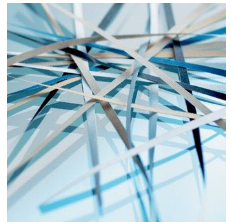
P-2 security: recommended, for example, for data media containing internal data that are to be made illegible