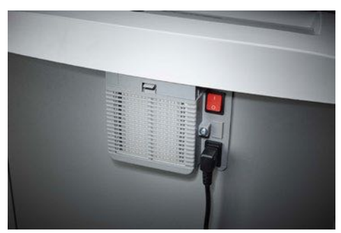
Dahle Waste 104air document shredder