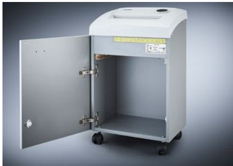
Dahle Waste 104air document shredder