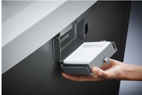
Dahle Waste 104air document shredder