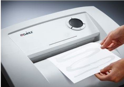
Dahle Waste 104air document shredder