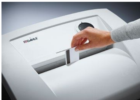
Dahle Waste 104air document shredder