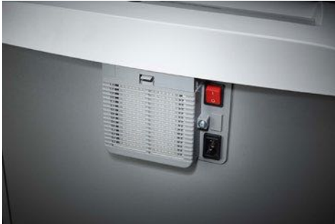
Dahle Waste 104air document shredder