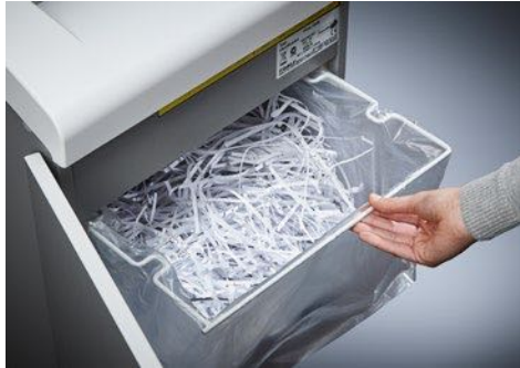
Dahle Waste 104air document shredder