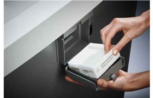
Dahle Waste 104air document shredder