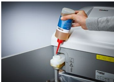
Dahle Top Secret 614 document shredder