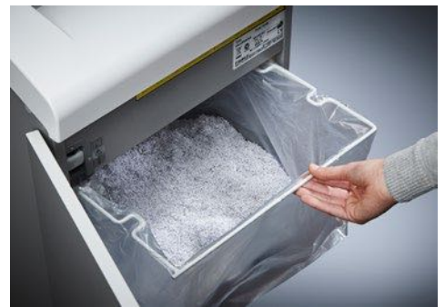
Dahle Top Secret 614 document shredder