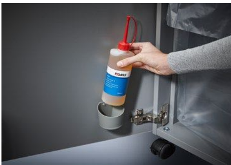
Dahle Top Secret 614 document shredder