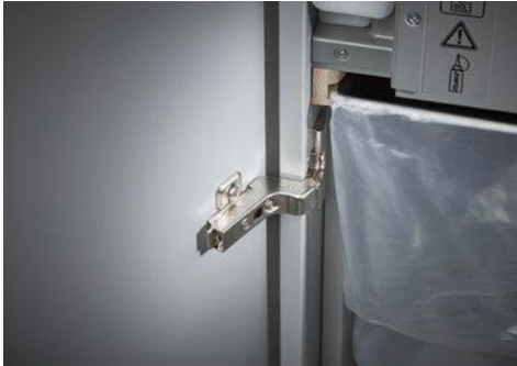
Dahle Top Secret 716air document shredder