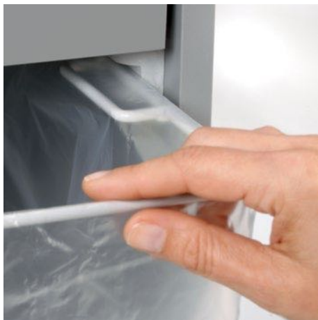
Pull-out rounded top frame that's kind on the fingers when changing the waste bag