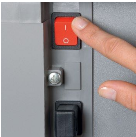
Separate main switch is located on the rear of the document shredder and completely disconnects it from the mains power supply