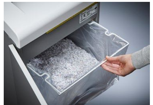
Dahle Security 514 document shredder