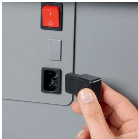
Detachable IEC power plug makes the document shredder quick and easy to move from A to B