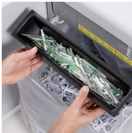
Separate, integrated waste boxes help to sort shredded paper, CDs, DVDs, cheque and credit cards for eco-friendly recycling