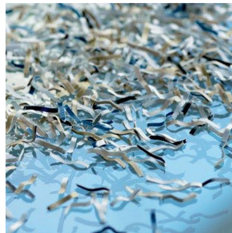
P-5 security: recommended, for example, for data media containing secret data