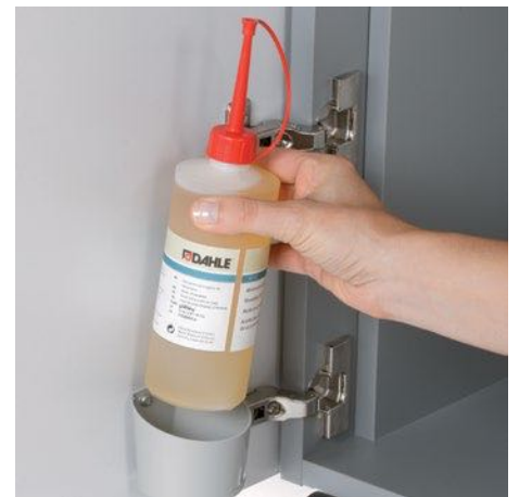
Environmentally friendly oil is always easy to access, included with all cross-cut models