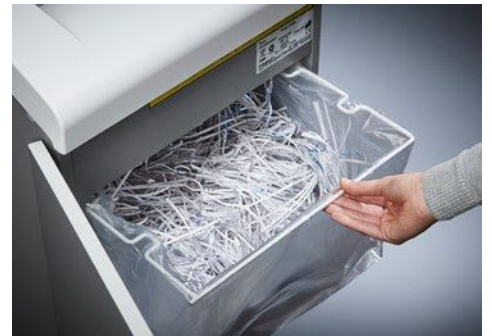
Dahle Waste 210 document shredder