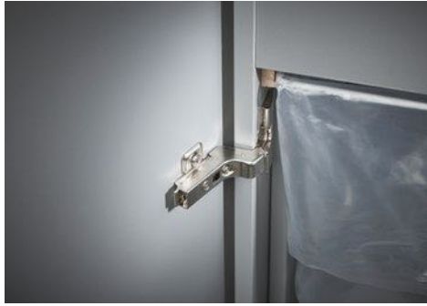
Dahle Waste 210 document shredder