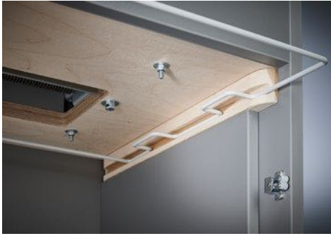
Dahle Waste 210 document shredder