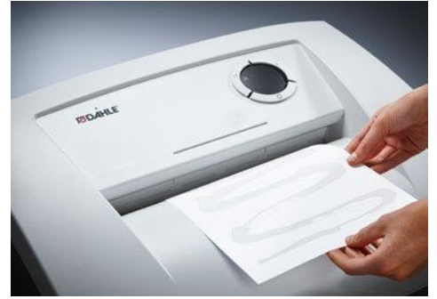
Dahle Waste 210 document shredder