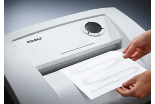
Dahle Waste 106 document shredder