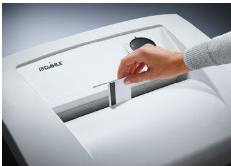
Dahle Waste 106 document shredder