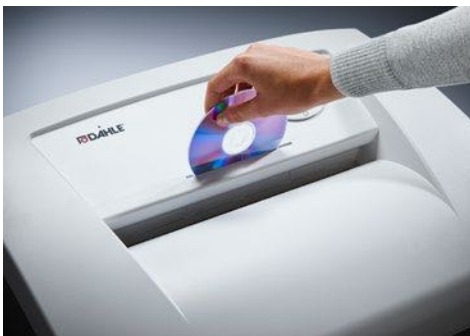
Dahle Waste 106 document shredder