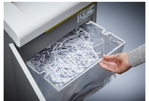
Dahle Waste 106 document shredder