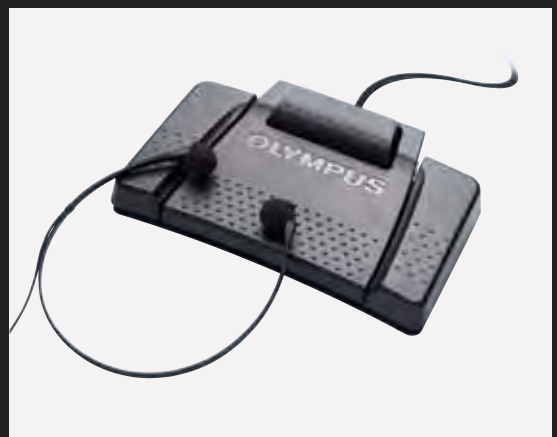
AS-9000 includes RS-31H, E-102, ODMS Transcription Module (Single License)

ODMS Transcription module provides a seamless interface to Dragon NaturallySpeaking* and reduces time for transcription further more.