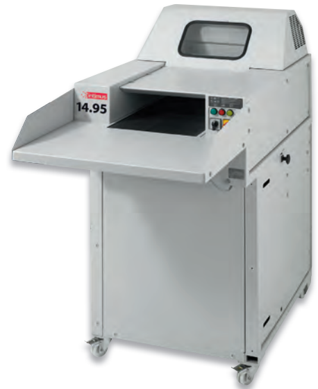
W/D/H 80/120 x 167 x 163 cm

For decades, the intimus® heavy duty shredders have proven to be centrally positioned pieces of equipment for the privacy-friendly disposal of disused media. The model range offers variations that can handle up to 550 sheets/h or even complete folders in a single operation. The spacious feed table with integrated infeed conveyor belt provides controlled, effortless, safe and fast loading. The shredded material is collected in large-scale, mobile or swing-out containers under the cutting mechanism. The shred-press combinations are coupled to a baler for immediate fully automatic compaction of the cut material into compact bales. Reduction effect compared to the loose collection of the cuttings is about 70%.