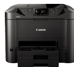
MAXIFY MB5450 series