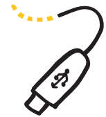
Plug & Play

The Bi-Bright interactive whiteboard is touch-sensitive and recognizes the presence of a pen, finger or wand on the board surface.