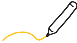
Ceramic steel surface