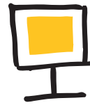
Windows · MAC · Linux