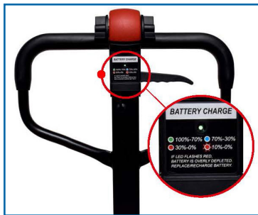
Battery Life Indicator