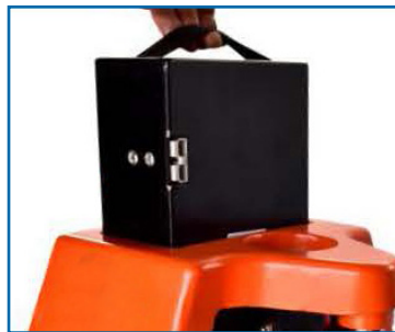
Easy to remove Lithium battery