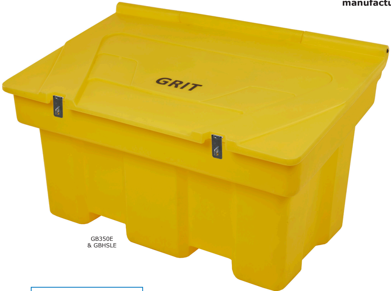
GB350E & GBHSLE