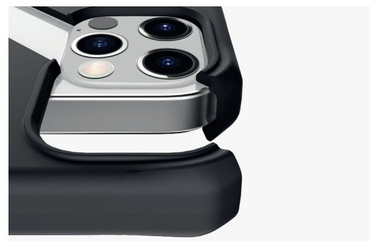
Protect your screen and camera lens

Our ion anti-microbial technology works at a cellular level to continually disrupt the growth and reproduction of micro-organisms. This creates a multi-point attack, damaging the protein, cell membrane, DNA and internal systems of bacteria, and many common viruses.