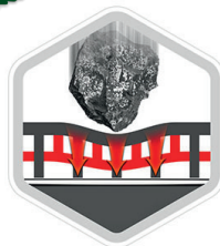
The first layer of resistance