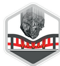
Adding resistance on impact with the second layer

Using air as a mattress to absorb the shocks, the honeycomb - design micro air pockets now have an extra layer that enables a 2 Step resistance against Kinetic energy generated if you drop your phone.