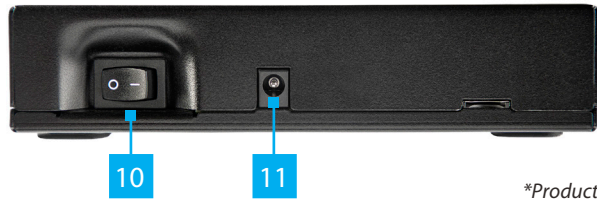
Top Edge View