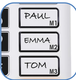
3 direct memory keys with customizable cards