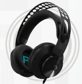
Lenovo Legion H300 Gaming Headset

* Example of Lenovo Legion catalogue naming convention