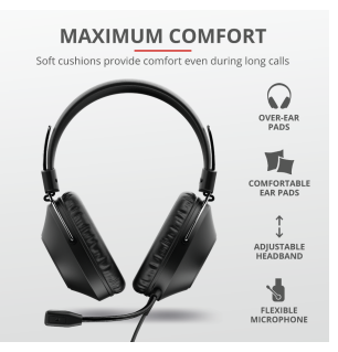
PRODUCT PICTORIAL 3