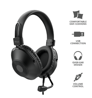
PRODUCT ESHOT 1