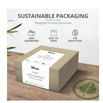
PRODUCT PICTORIAL 4