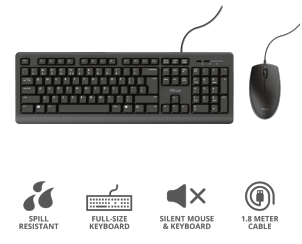
PRODUCT ESHOT 1