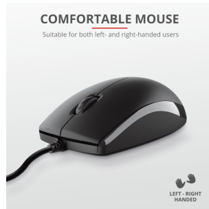
PRODUCT PICTORIAL 4