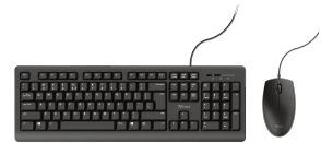
PRODUCT TOP 1