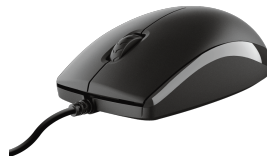
PRODUCT VISUAL 3