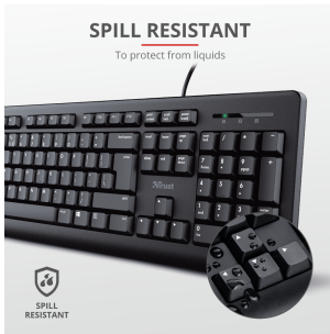
PRODUCT PICTORIAL 3