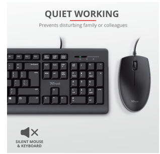
PRODUCT PICTORIAL 2