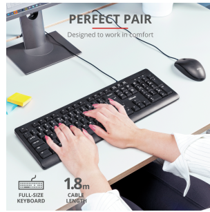
PRODUCT PICTORIAL 1