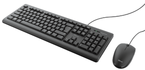
PRODUCT VISUAL 2