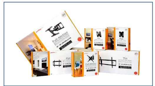
Comes in color packaging with included installation hardware and easy to follow instructions.