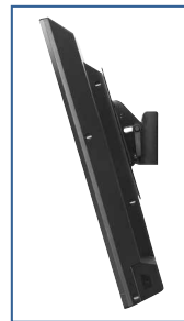
15°/-5° of tilt for versatile viewing angles.

Please visit peerless-av.com/en-us/patents for patent information.