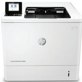
HP LaserJet Enterprise M608dn