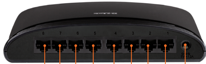
8 RJ-45 10/100 BASE-TX PORTS Connects to computers, print servers, or network storage