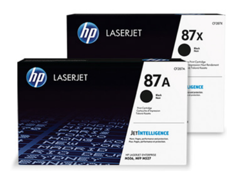
Original HP Toner cartridges with JetIntelligence

Bring out the best in your printer. Print more consistent, high-quality pages than ever before, <sup>3</sup> using specially designed Original HP Toner cartridges with JetIntelligence. Count on better performance, higher energy efficiency, and the authentic HP quality you paid for—something the competition simply can't match.<sup>3</sup>