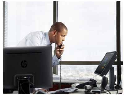
Simple one-to-one device management

The printer can also be managed using the HP Embedded Web Server. Use a web browser to monitor status, configure network parameters, or access device features.