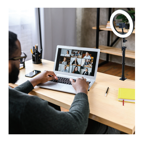
Optimized Office Lighting

Part Number: K87653WW | UPC Code: 085896876533