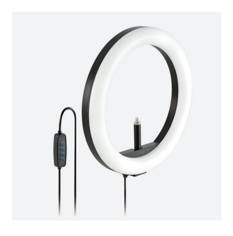
Push Button Controls

Select the best light color (cool, natural, warm) anywhere, anytime.