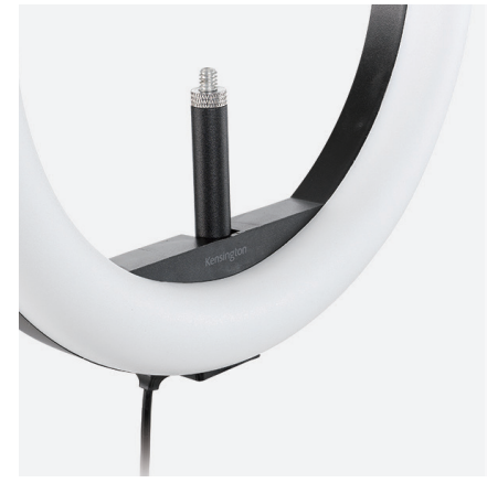
Center-Ring Webcam Mount

No outlet required—simply attach to any open USB-A port (5V/2.0A).