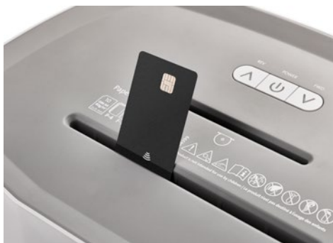
DAHLE PaperSAFE® document shredder 420 DAHLE PaperSAFE® document shredder 420