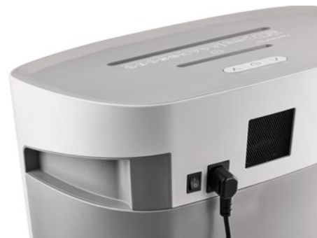
DAHLE PaperSAFE® document shredder 420 DAHLE PaperSAFE® document shredder 420 DAHLE PaperSAFE® document shredder 420