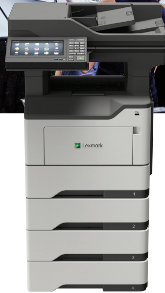
MB2650adwe with optional trays