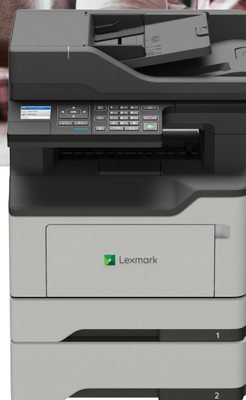
MB2338adw with optional tray