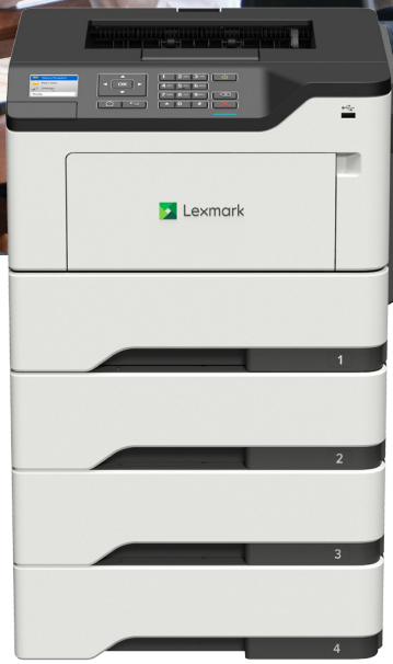
B2650dw with optional trays