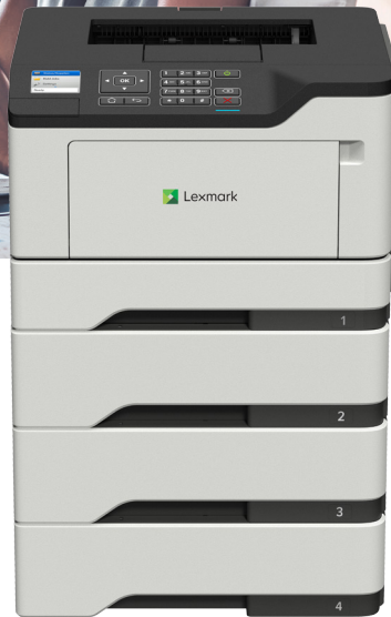
B2546dw with optional trays