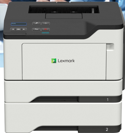
MS421dw with optional tray