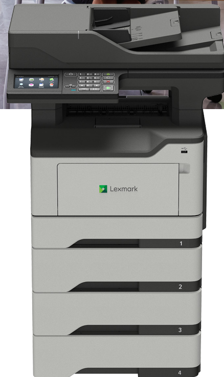
MX522adhe with optional trays