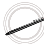
Lenovo Active Pen*