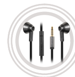
Lenovo 500 Extra Bass In-ear Headphones*