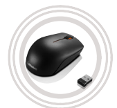
Lenovo 300 Wireless Mouse*