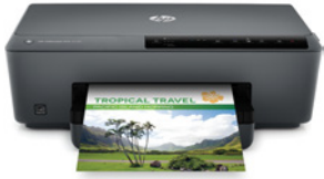
HP Officejet Pro 6230 ePrinter

The following table compares the new HP Officejet Pro 6230 ePrinter with the HP Officejet 6100 ePrinter.