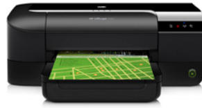
HP Officejet 6100 ePrinter