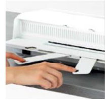
Foldable exit tray