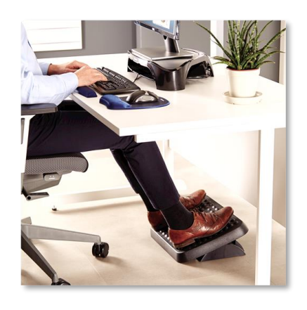
Large foot platform

A free-floating platform allows legs to stretch for increased circulation.