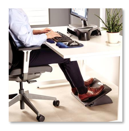
Ergonomic positioning Elevates feet and legs to help relieve lower back pressure and improve posture.