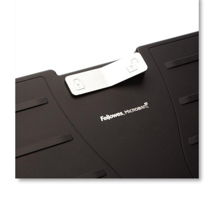
Rocking feature Rock freely back and forth to help stimulate foot and

leg circulation or lock in place for firmer support.