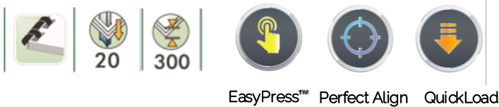
EasyPress™ Perfect Align QuickLoad