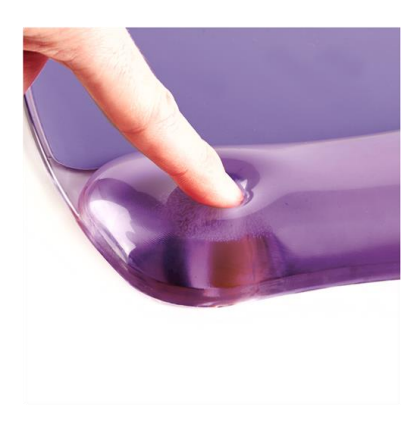
Gel Soothing gel provides added comfort and support

Provides support to your wrists, ensuring your forearms are horizontal and wrists are in a neutral position.