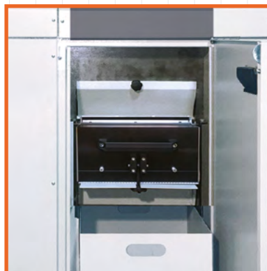
Easy access to cutting units and waste container