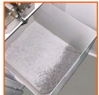
Easy removal and emptying of waste container