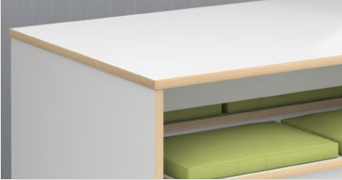
Table top and leg panels manufactured from 25mm melamine with slab ends with adjustable feet. Combine the brilliant white laminate finish with a plywood edge